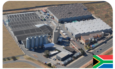
AGT Foods Africa / Advance Seed Johannesburg, South Africa