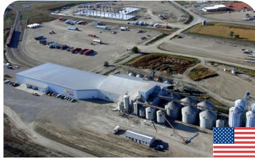
AGT Foods USA Williston Williston, ND, USA