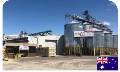
AGT Foods Australia Horsham Horsham, Victoria, Australia