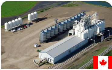
AGT Foods Canada Rosetown PD Rosetown, SK, Canada