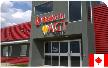
AGT Foods Head Office Regina, SK, Canada

AGT Foods operates 40+ facilities across Canada, the U.S., Türkiye, Australia and South Africa as well as sales offices in India, the U.K., Europe and China.