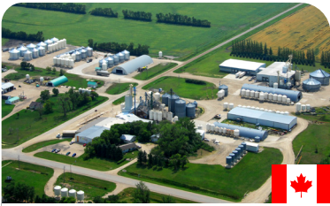
AGT Foods Canada St. Joseph St. Joseph, MB, Canada