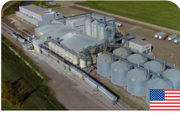
AGT Foods USA Minot Minot, ND, USA