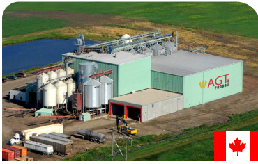
AGT Foods Canada Regina Main Regina, SK, Canada