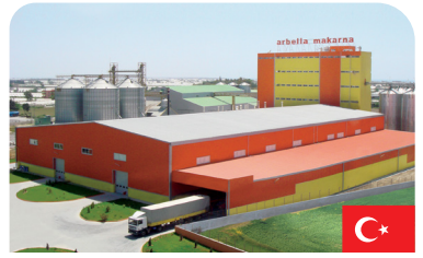
Arbella Pasta Mersin, Türkiye