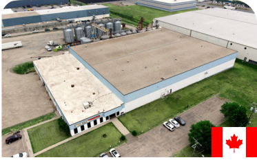
AGT Foods Canada Regina City Regina, SK, Canada