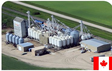
AGT Foods Canada Oat Milling Aberdeen, SK, Canada