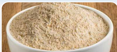
Protein Concentrates and Isolates