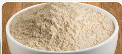
High Viscosity Flour V-6000™