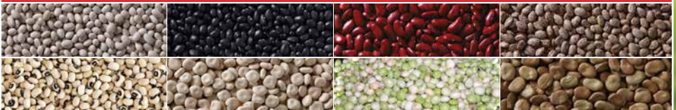
Beans, Pigeon Peas, Lupins and Other Dry Beans