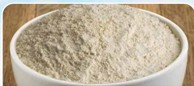
Flours and Semolinas

AGT Foods is a leading manufacturer of plant-based food ingredients . From our facilities in Minot, ND, USA and Regina, SK, Canada, we produce nutritious, non-GMO, gluten-free and non-allergenic ingredient products , including pulse flours, proteins, fibres, V-6000™, de flavoured flours and crumb, as well as extruded products such as texturized pulse protein (TPP), crisps and gluten-free pasta. We provide quality solutions for the global food marketplace.