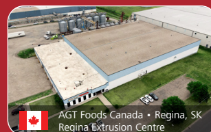
AGT Foods Canada • Regina, SK Regina Extrusion Centre