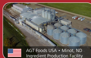
AGT Foods USA • Minot, ND Ingredient Production Facility

AGT Foods is a leading manufacturer of plant-based ingredients for premium markets and food companies around the world. From our facilities in North Dakota and Saskatchewan, we produce nutritious, non-GMO, gluten-free and non-allergenic ingredient products , including pulse flours, proteins, fibres, V-6000™, de flavoured flours and crumb, as well as extruded products such as texturized pulse protein (TPP) and gluten-free pasta. We provide quality solutions for the global food marketplace.