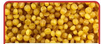
Acini de Pepe